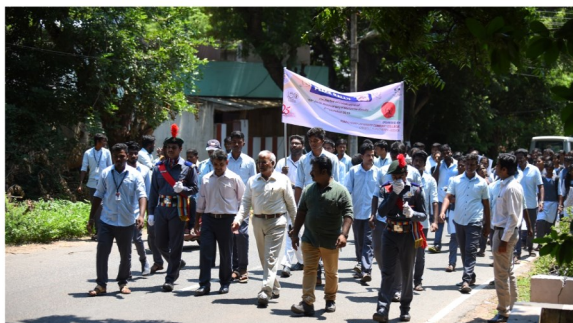
"Peace Rally" on 150th Gandhi Jayanti Celebration