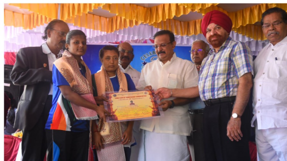
Students receiving award from Hon'ble VC & Shri. M.O.H.F. Shahjahan, Hon'ble Minister