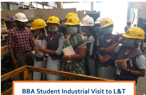
BBA Student Industrial Visit to L&T with faculty member